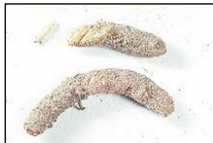
10. Egg pod and exposed eggs in bottom of broken egg pod.