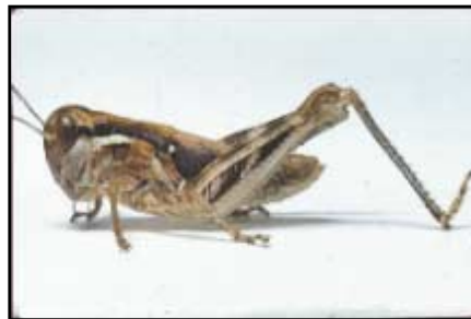
5. BL 16-23 mm FL 10-13 mm AS 22-24.

Figures 1-5. Appearance of the five nymphal instars of M. sanguinipes - their sizes, structures, and color patterns. Notice progressive development of the wing pads. BL = body length, FL = hind femur length, AS = antennal segments number.