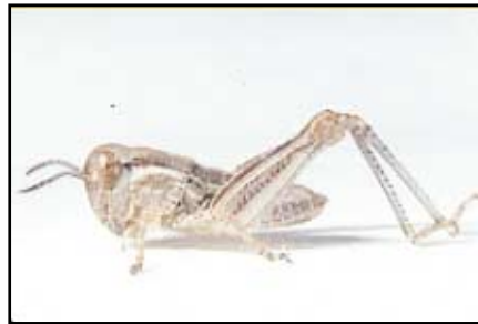
3. BL 8-11 mm FL 5.5-6.1 mm AS 18-20.