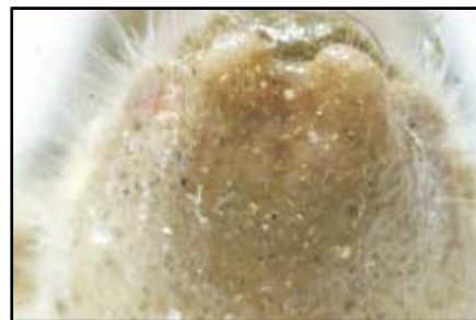
9. End view of male abdomen, showing notch in the subgenital plate.