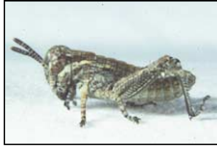
1. BL 4-6 mm FL 2-2.9 mm AS 12-13.