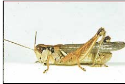
6. BL 20-26 mm FL 11-12.5 mm AS 24-27.

Nymphs grow and develop during late spring when days are long, weather is usually warm, and food plants are green and abundant. Under these favorable conditions the young grasshoppers pass through the nymphal stage in 35 days. Cool weather, however, may lengthen the nymphal stage to 55 days. Nymphal instars range from five to six; the females usually require the larger number.