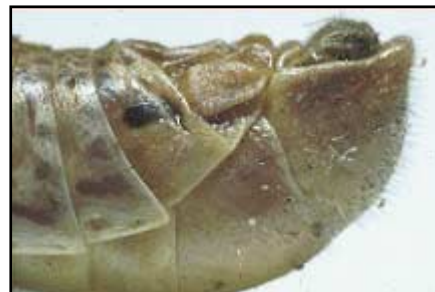
8. Side view of end of male abdomen.