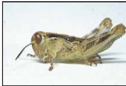
4. BL 11-16 mm FL 7.6-8.6 mm AS 21-22.