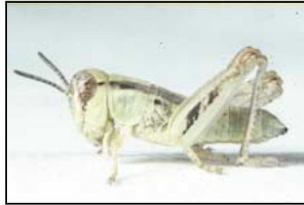
2. BL 6-8 mm FL 3-4.3 mm AS 15-17.